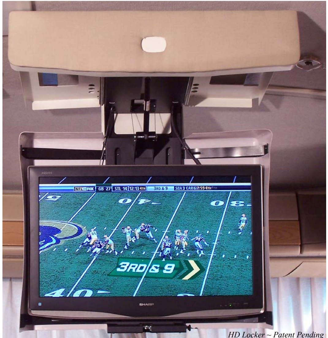
HD Locker ~ Patent Pending

The HD Locker® provides the unique installation of a 37" Flat Screen LCD HDTV in your RV. The HD Locker mounts firmly to the roof of the RV holding the HDTV close to the ceiling while in transit, then drops down for optimum viewing once parked.